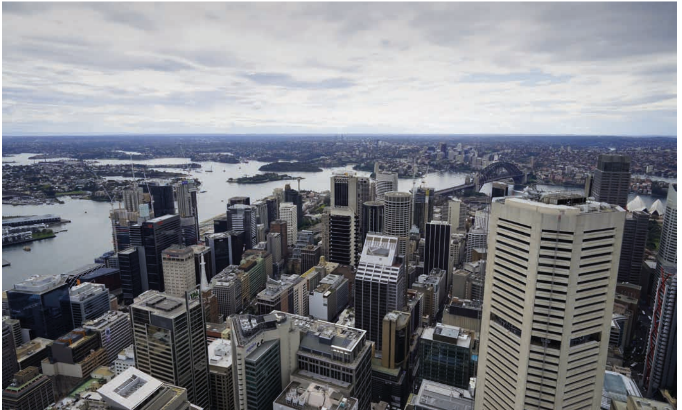
AM_15 Sydney Tower Potential View